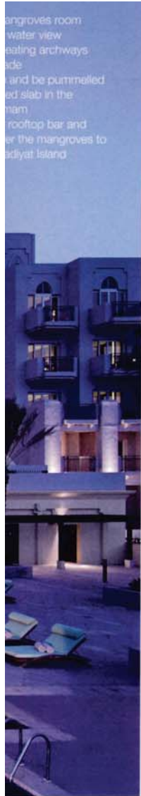
... mangroves room ... water view ... eating archways ... side ... and be pummelled ... ed slab in the ... mam ... rooftop bar and ... er the mangroves to ... adiyat Island