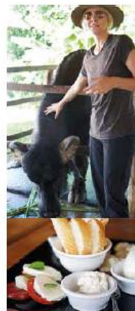
Australian Susie Martin (top) set up the Laos Buffalo Dairy Farm, where you can pop by for buffalo cheese and cakes.