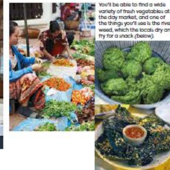
You'll be able to find a wide variety of fresh vegetables at the day market, and one of the things you'll see is the river weed, which the locals dry and fry for a snack (below).

We're giving away stays in the Avani+ Luang Prabang. See page 118 now!