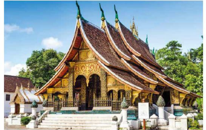
The oldest and best-known temple in Luang Prabang, the Wat Xieng Thong, is located on the main street and has intricate mosaic work on its walls. Below: Take a half-day trip to the beautiful three-tier Kuang Si Falls, where you can take a dip in the azure pools.

Ideally poised to take all these in is the Avani- Luang Prabang ( www.avanihotels.com/luang-prabang ). Itself a preservation building, the hotel was converted from a bungalow