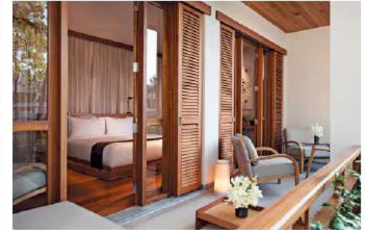
Clockwise from top left: Relax in Avani+ Luang Prabang's 25-metre pool after a day of exploring. The hotel's Courtyard rooms have French-louvred doors that open out to a balcony facing the pool. If the heat proves too much, hop onto one of the tuk-tuks to take you down the peninsula.

milking came off a YouTube video, confesses Susie. And now, the farm makes its own mozzarella, ricotta and ice-cream, and you can stop for a tea break to enjoy the scrumptious cakes. For tour details, visit www.laosbuffalodairy.com/tours/