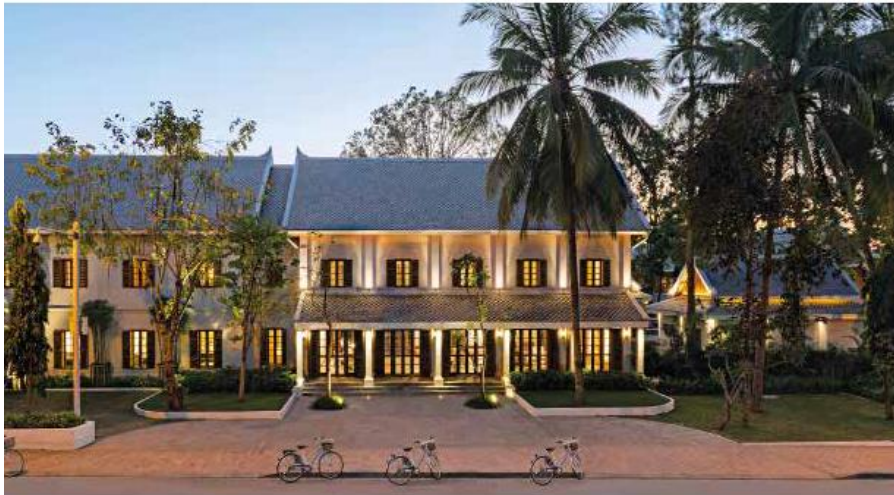
Steps away from the Mekong River, markets and temples, the Avani+ Luang Prabang is perfectly poised for you to explore the historic UNESCO Heritage Town.

for French military brass in 1914. Respecting its UNESCO Heritage Town surroundings, the resort's wraparound balconies and facade elegantly merge into the surrounding streetscape of colonial architecture. Guest rooms offer an open plan living experience with French-style louvred wooden doors that open out to a balcony overlooking the pool or private courtyard. By the way, the 25-metre pool offers a welcome relief from the tropical heat and humidity after a day of exploring.