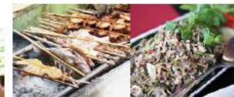
Whether it's charcoal-grilled street food or traditional dishes like larb (right), there are so many different things to tempt the taste buds.