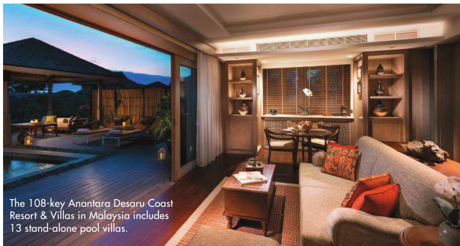
The 108-key Anantara Desaru Coast Resort & Villas in Malaysia includes 13 stand-alone pool villas.

The elevated Observatory Bar affords 360-degree views of the resort and ocean, as well as an extensive range of top vintages and spirits, plus imported cigars. The brand's signature Dining by Design private dining experience is also available as well.