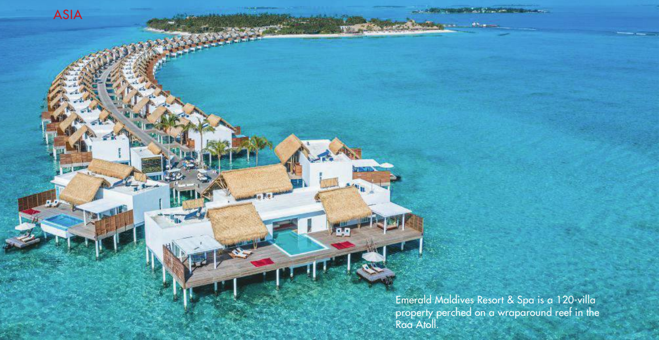
Emerald Maldives Resort & Spa is a 120-villa property perched on a wraparound reef in the Raa Atoll.