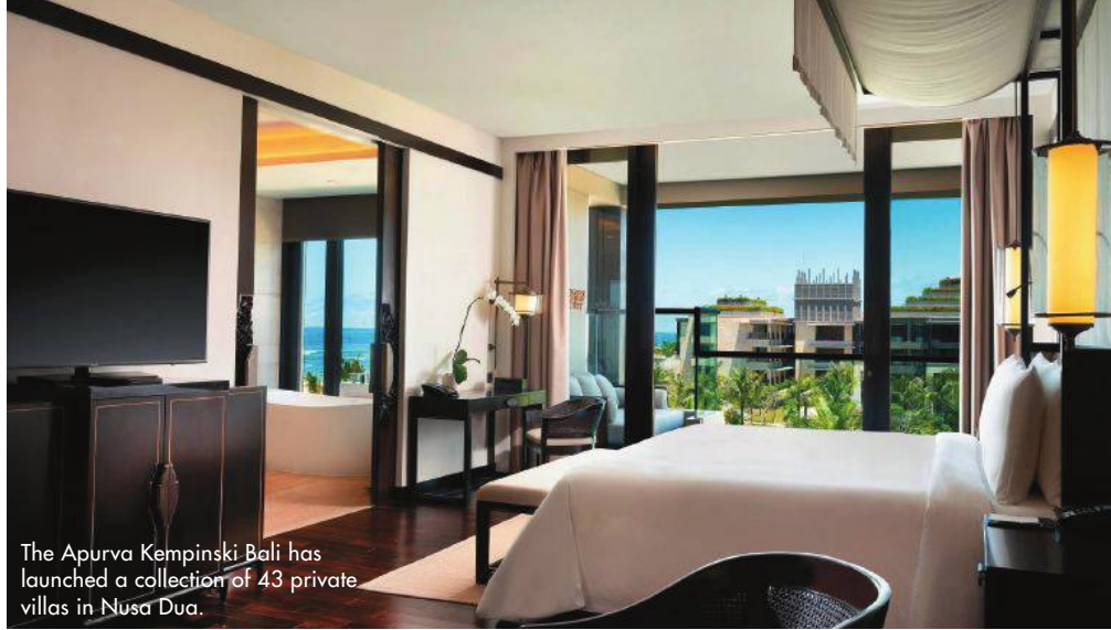
The Apurva Kempinski Bali has launched a collection of 43 private villas in Nusa Dua.

For dining, guests can enjoy grilled seafood and steaks served beachside at the al fresco Sea.Fire.Salt restaurant, while The Turmeric specializes in authentic local Malaysian fare and Thai, Chinese and international cuisine.