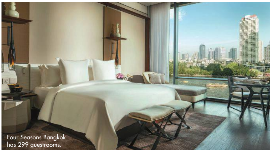
Four Seasons Bangkok has 299 guestrooms.