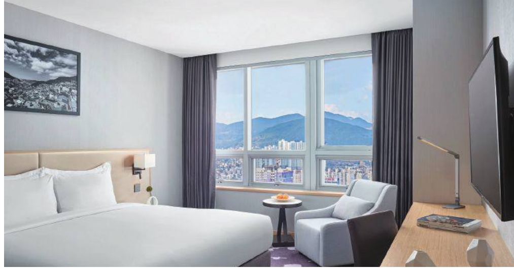
Avani Central Busan Hotel , which opened in February in the heart of Busan, Korea, has 289 contemporary guestrooms and suites, offering mountain or city views.

Belgium-based hospitality company Zannier Hotels is set to make a splash in Vietnam this summer with the opening of Bãi San Hô , a new beachfront resort. Nestled on a 240-acre estate of lush gardens and pristine beachfront in Phu Yen province, a coastal enclave known for its stunning beaches and landscapes in the south of the country, Bãi San Hô will have 71 villas divided into three architectural types: Hill Pool Villas, designed in the style of the Ede tribes; Beach Pool Villas, inspired by the Cham tribes; and Cluster Villas, built on traditional stilts next to rice paddies. Note that 46 of the villas will come with their own private pools.