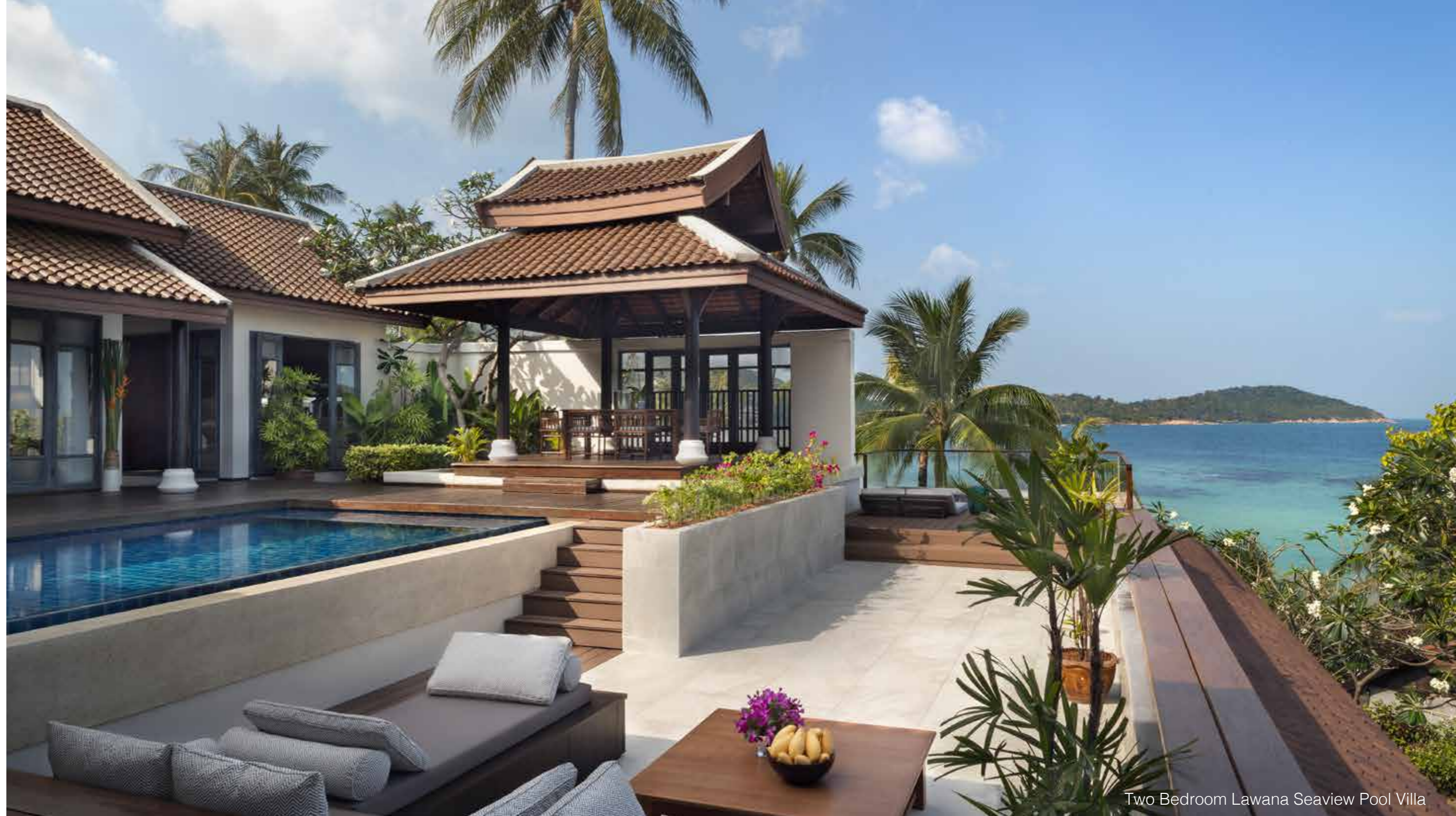
Two Bedroom Lawana Seaview Pool Villa

Spend holiday time with family or friends in 300 sqm of palatial accommodation. Gaze across unobstructed sea views from almost every angle of the villa. Soak in the sun on your private sundeck. Unwind in the huge living space with all the modern amenities you could ask for. Guests staying in the Two Bedroom Villa can enjoy the services of a Villa Host, from pre-arrival through to departure.