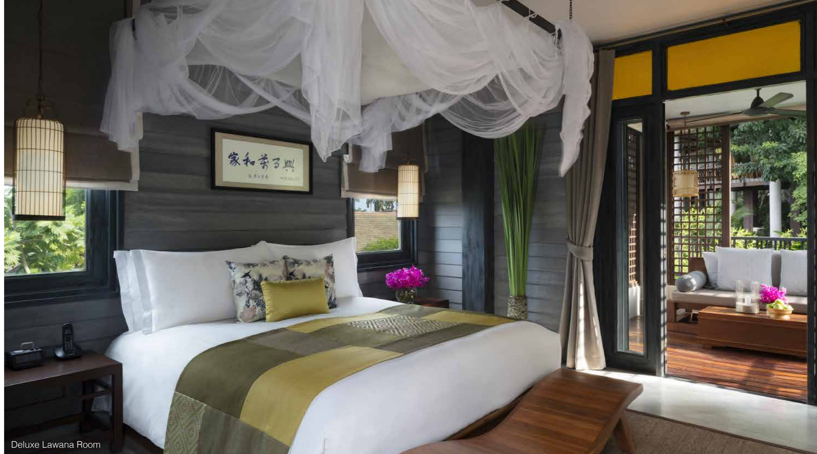
Deluxe Lawana Room

Enjoy master bedroom privacy and a thoughtful room layout ensuring restful sleep for everyone. Daydream or curl up with a book on a comfortable window side sofa in the second room, which can be used as a kids' bedroom thanks to wrap-around blackout curtains. Wake up to views of a sun-washed garden and gentle ocean breeze.