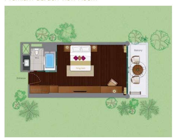
Junior Lagoon View Suite